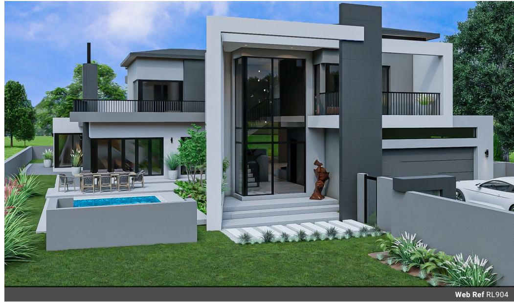
Web Ref RL904